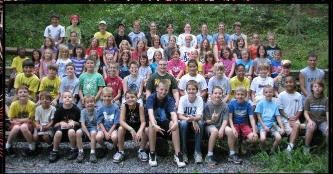
Junior Week 2011

Bancroft Bible Camp 141 Bancroft Private Drive Kingsport, TN 37660 For information call: (423)-288-4532 or (423)-288-2713 www.bancroftbiblecamp.org