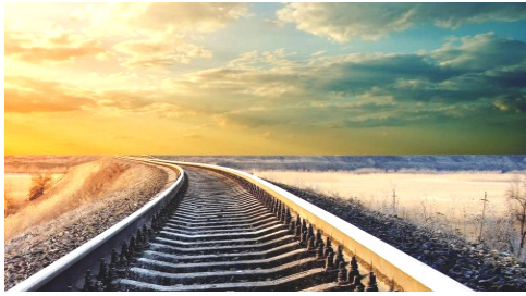
“On the Right Track”

Non-Profit Org. U.S. Postage Paid Permit No. 289 Kingsport, TN 37660