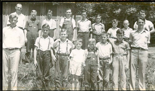
1st Boy's Camp